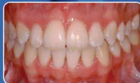
Case 4: Class III with a Constricted Maxilla