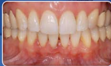
Case 3: Bilateral Class I Canines and Midline Offset