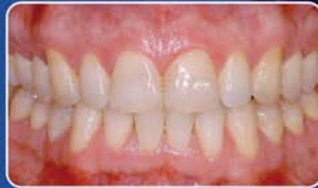
Case 2: Class II Dianterior Deep Bite