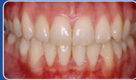
Case 1: Class II Anterior Crowding