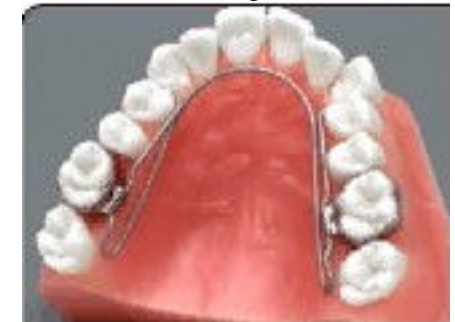
Quad Helix Expander

A Quad Helix is a device similar to a Lingual Arch but instead of holding teeth in their present positions it will widen or expand the back teeth. This is usually done in growing children but can at times be used for adult patients. It attaches onto the top back molar bands and is activated or widened at each visit. It remains in place for about 4 - 6 months. Because of its design it may be harder to remove food from the small loops but with practice most patients manage when you use the special brushes available from our office.